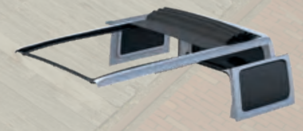
SKY ONE-TOUCH® POWER TOP The first-ever power top on a Wrangler model invites in the fresh air with the push of a button. Open up even more with the easy-to-remove<sup>2</sup> rear glass quarter panels. Available on Sahara® and Rubicon® Wrangler Unlimited models.

FREEDOM TOP® MODULAR HARDTOP This three-piece hardtop is light and easy to remove? For a full open-air experience, you can remove<sup>2</sup> all three sections or let in the sun by just removing<sup>2</sup> the two front panels. Available.